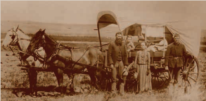
Wagon train family

In the mid-nineteenth century, emigrant wagon trains also camped in great numbers around these springs allowing animals to graze after the arduous crossing of the Black Rock Desert. The springs must have been a welcome retreat from the harsh and monotonous dry lake bed.