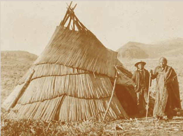
Northern Paiute Chief Ocheo in front of Paiute tule mat house

The Native people used the plants, animals and rocks that you might see near these springs for food, fiber and tools. Stone artifacts are the reminders of their ancient culture and traditions. Please respect their heritage and leave artifacts in place.