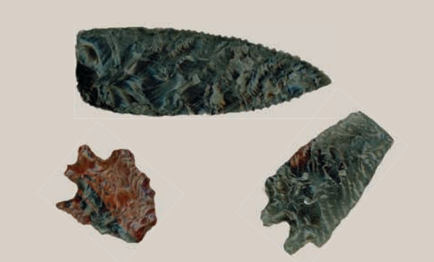
Examples of prehistoric projectile point

The first people to use these springs have occupied the Great Basin for over 10,000 years. The Northern Paiute band in this region is called Aga'ipanadokado or "fish lake eaters."