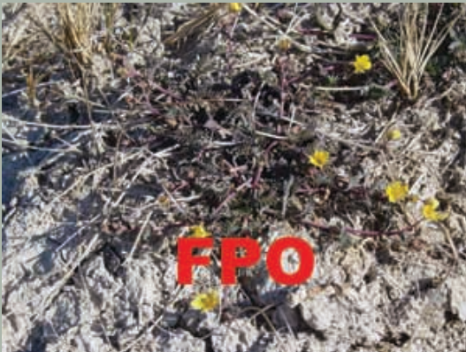
Basalt Cinquefoil in bloom (yellow flowers)

Basalt Cinquefoil is a low growing wildflower living on the gentle slopes and alkaline soils that surround the springs. The small yellow flowers bloom in abundance during May and June. Many of the existing roads and campsites caused negative impacts in Cinquefoil habitat.