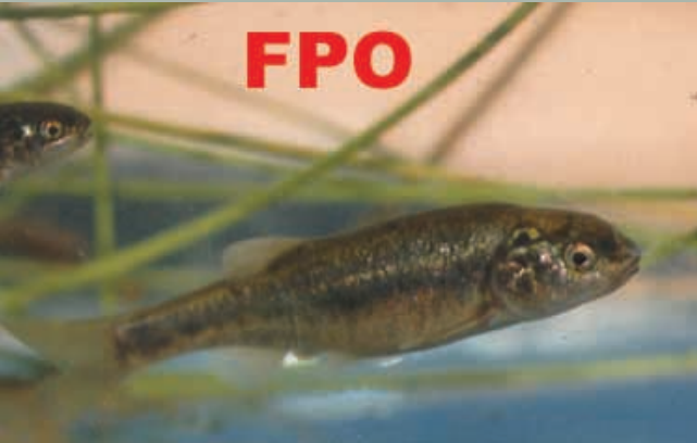
Desert Dace close up

Soldier Meadows is a spring fed wetland inhabited by fish and springsnails that do not live anywhere else. These animals were isolated from their ancestors when warming climates caused Lake Lahontan to dry up about 9,000 years ago.