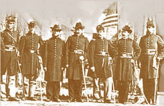
U.S. Cavalry ca 1865

In the mid-nineteenth century, emigrant wagon trains also camped in great numbers around these springs allowing animals to graze after the arduous crossing of the Black Rock Desert. The springs must have been a welcome retreat from the harsh and monotonous dry lake bed.