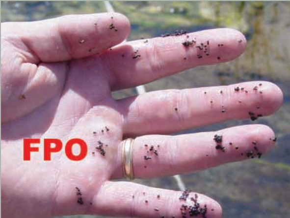
Hand covered with hundreds of tiny springsnails

The Soldier Meadows Springsnails were recently discovered and are among approximately 100 aquatic mollusks known only to exist in the Great Basin. There are several species of snails living in the springs at Soldier Meadows. The construction of rock dams to make hot pools for bathing destroys springsnail habitat.