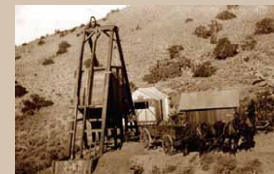
1912 Jackson Mountain copper mine

Since these early mining attempts, prospecting for silver, gold, uranium, opals, sulphur, antimony, tungsten, gypsum, petroleum, and nitrates has taken place within the NCA. Prospects, shafts, adits, mining equipment, mining claim markers, small structures, and foundations can still be found. Today, only traces remain of other towns such as Sulphur, Rosebud, and Scossa that were established in or near the NCA.