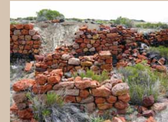
Hardin City rock walls